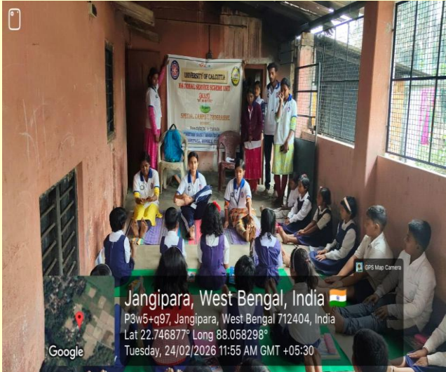
Jangipara, West Bengal, India P8w5+q97, Jangipara, West Bengal 712404, India Lat 22.746877° Long 88.058298° Tuesday, 24/02/2026 11:55 AM GMT +05:30