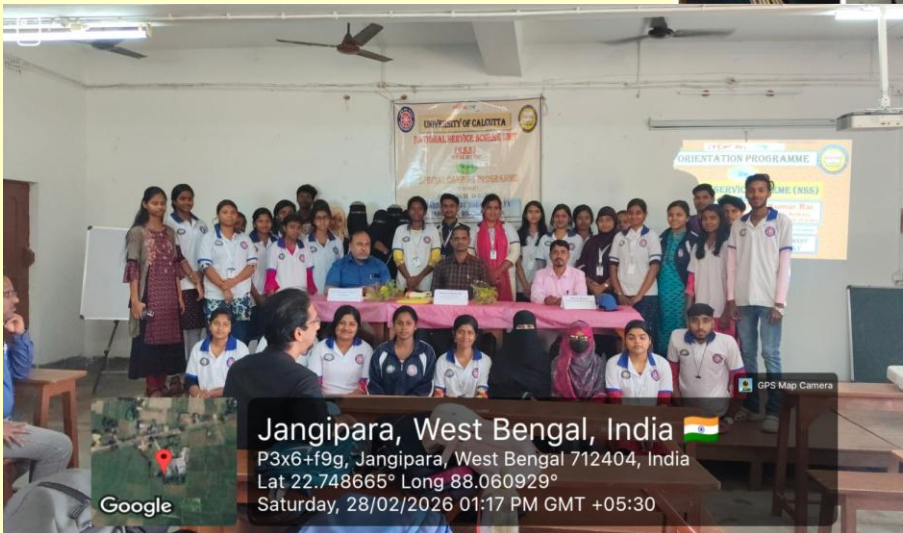
Jangipara, West Bengal, India P3x6+f9g, Jangipara, West Bengal 712404, India Lat 22.748665° Long 88.060929° Saturday, 28/02/2026 01:17 PM GMT +05:30