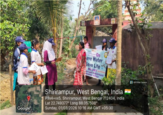
Shirirampur, West Bengal, India P8x4+vx5, Shirirampur, West Bengal 712404, India Lat 22.749377° Long 88.057508° Sunday, 01/03/2026 10:16 AM GMT +05:30