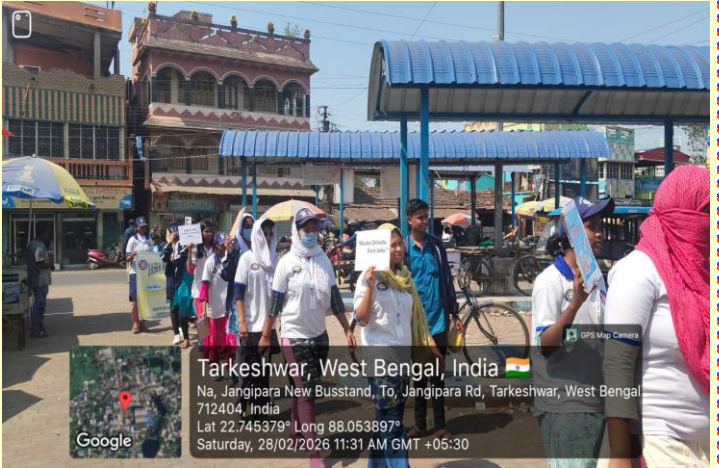
Tarkeshwar, West Bengal, India Na, Jangipara New Busstand, To, Jangipara Rd, Tarkeshwar, West Bengal 712404, India Lat 22.745379° Long 88.053897° Saturday, 28/02/2026 11:31 AM GMT +05:30