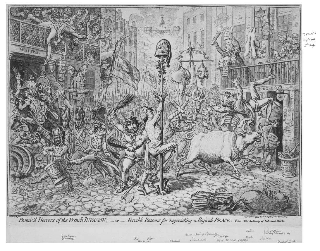
2 James Gillray, Promis'd Horrors of the French Invasion, – or – Forcible Reasons for Negotiating a Regicide Peace (London: H. Humphrey, 20 October 1796; BM 8826)